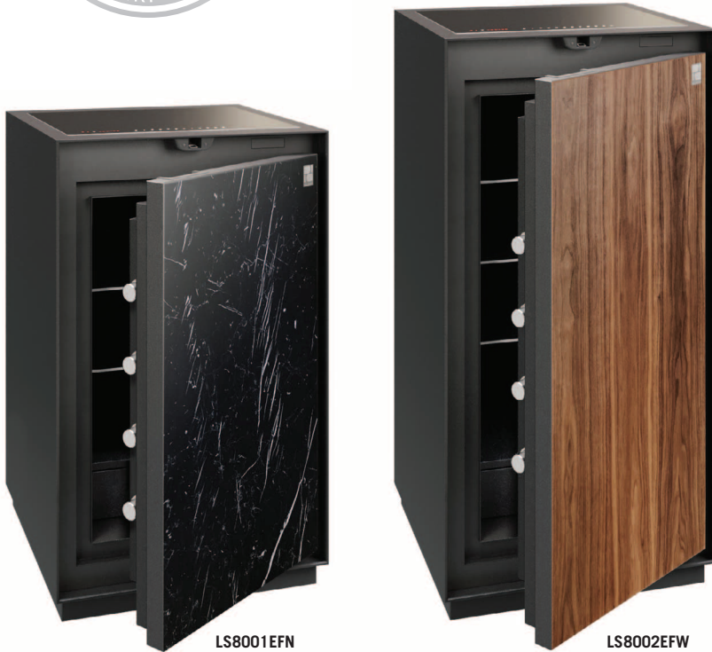
6 COLOUR OPTIONS